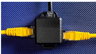
Part No: IPT-500-550

The IPLite units have IO ports to directly daisy chain up to 32 units on 1 x IP Address. For the IT version there is a daisy chain kit available. The IT versions will also support 32 devices on any configuration over a single IP address. Can mix and match any IPower products on the PDU Agent platform.