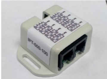
Part No: IPT-500-100

Daisy chain 8 x Temperature Sensor ports each with separate settings. Units come with 3mtr lead as standard but other lengths available. High/Low temperatures can be set and alerts reported or logged using PDU Agent.