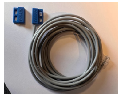
Part No: IPT-500-800