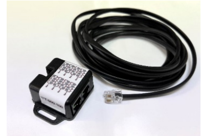
Part No: IPT-500-200