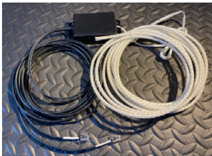
Part No: IPT-500-900-XX

Leak Tape available in 5mtr incremental lengths or as spot sensors as required. Any alert will be raised.